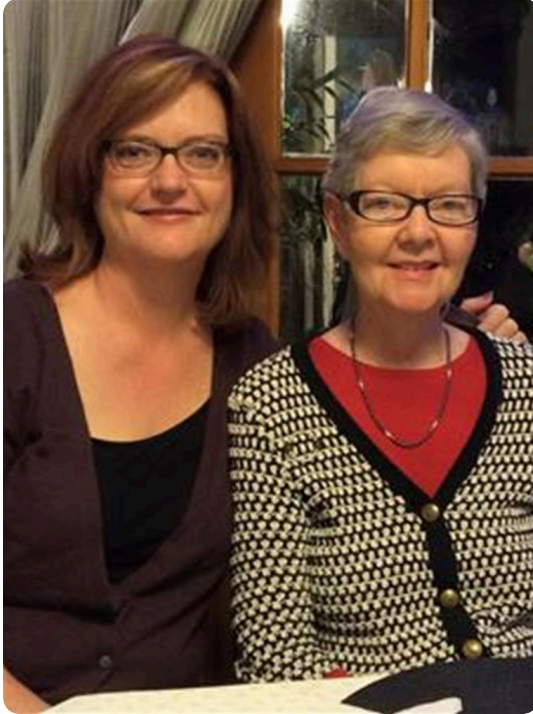
New Year's visit 2015