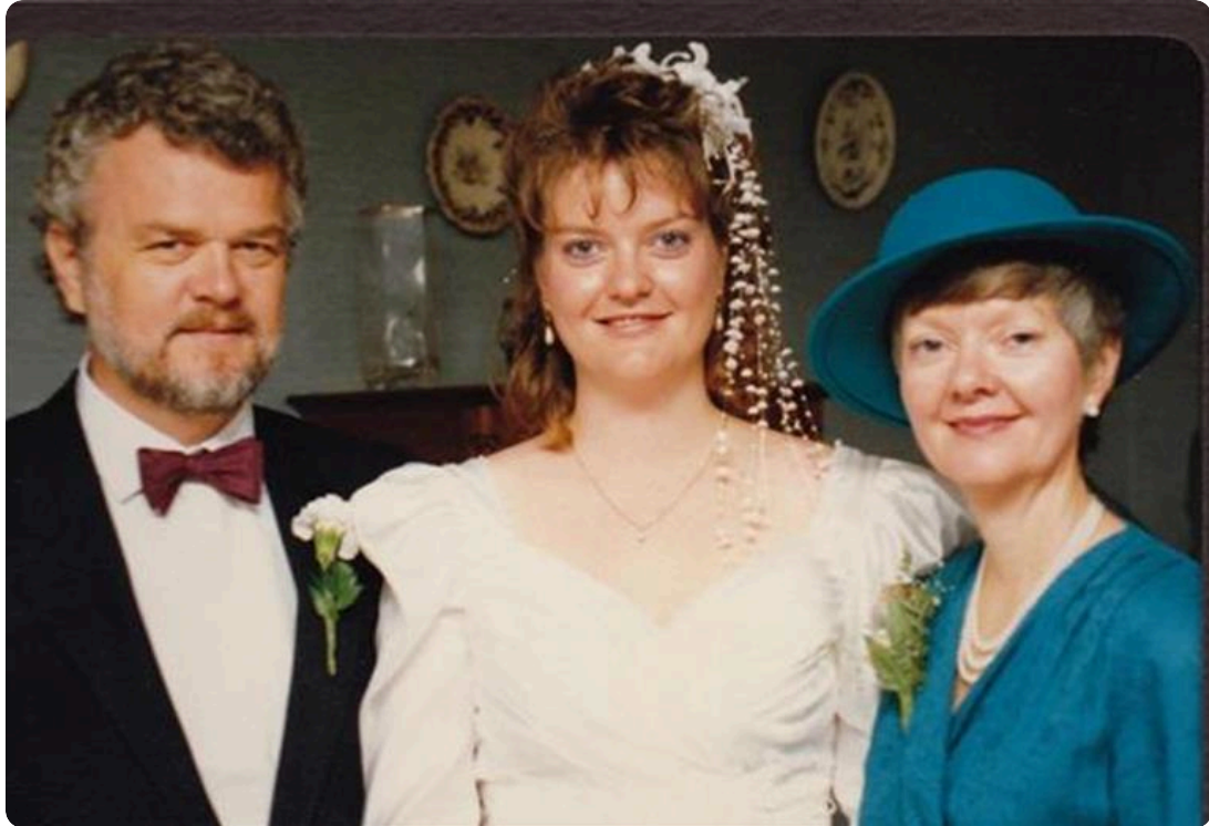
Our wedding day October 14,1989